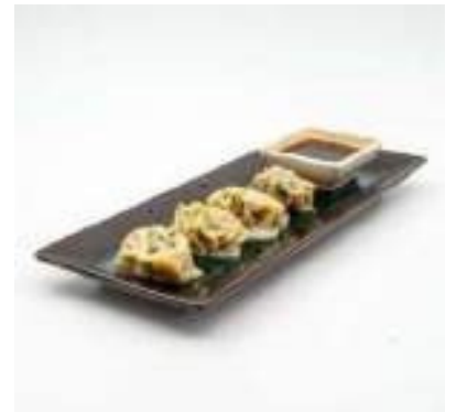
VEGETABLE GYOZAS (V) MIXED VEGETABLES WITH SPICY VINAIGRETTE SOYA SAUCE £9