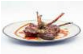
LAMB CHOPS 4PCS GRILLED LAMB CHOPS WITH KOREAN SPICY SAUCE