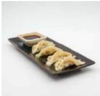
PRAWN GYOZAS PRAWNS, MIXED VEGETABLES WITH SPICY VINAIGRETTE SOYA SAUCE £10