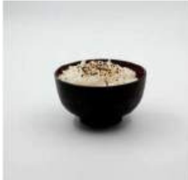
JAPANESE STICKY RICE (VG) SERVED WITH SESAME SEEDS £4.5