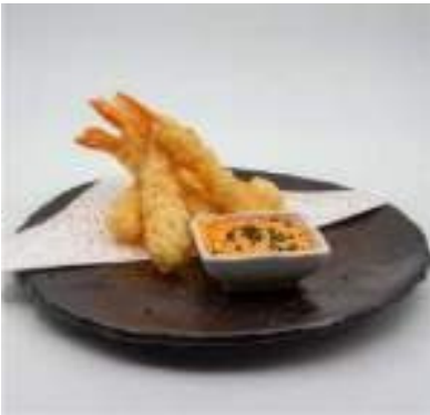
PRAWN TEMPURA FRIED PRAWNS WITH SPICY MAYO & CHIVES £13