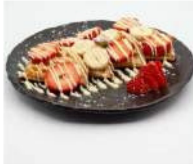
WHITE CHOCOLATE HEAVEN FRESH WAFFLE WITH BANANA & STRAWBERRY SLICES, WHITE CHOCOLATE SAUCE £10