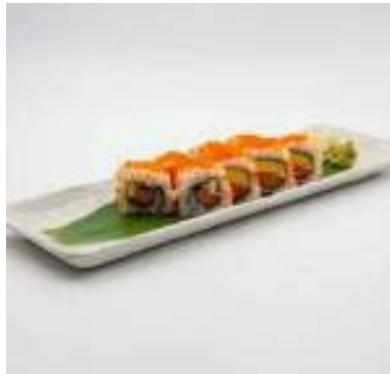
PHILADELPHIA SALMON 8PCS RAW SALMON, MANGO, CREAM CHEESE AND FISH ROE £14