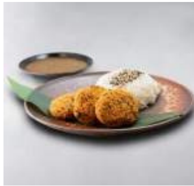
VEG KATSU CURRY SWEET POTATOES CUTLETS WITH JAPANESE CURRY GRAVY AND STICKY RICE £17