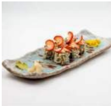
SALMON TEMPURA MAKI 6PCS SALMON HOSOMAKI, FRIED WITH TEMPURA BATTER SERVED WITH CREAM CHEESE, STRAWBERRIES AND SWEET SOYA £13.5