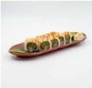
ASPARAGUS TEMPURA (VG) 8PCS FRIED ASPARAGUS SERVED WITH TERIYAKI SAUCE £12