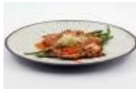
VEGETABLE NOODLES (V) SEASONAL VEGETABLES WITH YAKISOBA SAUCE AND NOODLES