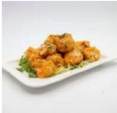
DYNAMITE CAULIFLOWER (V) BATTER-FRIED CAULIFLOWER COATED WITH DYNAMITE SAUCE, FRESH SPRING ONION, CHILLIES £12