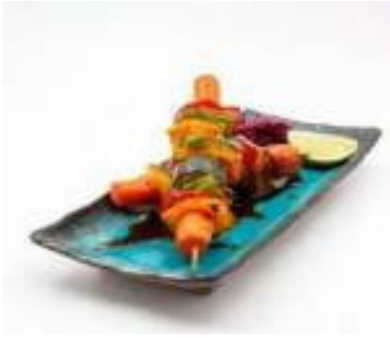
VEGETABLE SKEWERS (VG) 2PCS SEASONAL GRILLED VEGETABLES COATED WITH TERIYAKI SAUCE £11