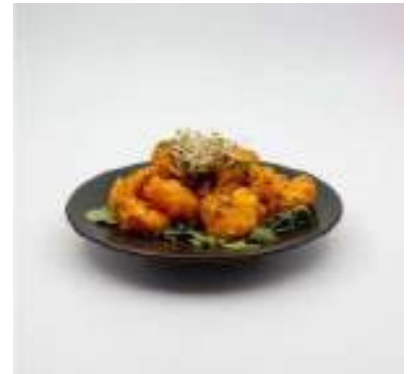
ROCK SHRIMP TEMPURA FRIED SHRIMP, CREAMY SPICY MAYO, CHIVES WILD MUSHROOMS & MIXED SALAD £14