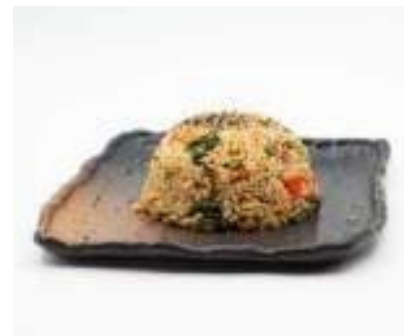
VEGETABLE FRIED RICE (V) VEGETABLES SERVED WITH HOT SEASONAL SAUCE £7