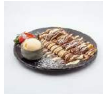
KINDER DELIGHT FRESH CREPE WITH MILK & WHITE CHOCOLATE SAUCE, KINDER BUENO PIECES £9