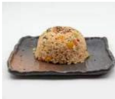
PRAWN FRIED RICE PRAWNS, VEGETABLES SERVED WITH YAKISOBA SAUCE £8