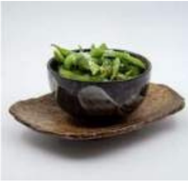
EDAMAME SALT (VG) SERVED WITH SEA SALT FLAKES £7