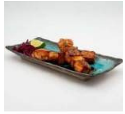
SALMON SKEWERS 2PCS PAN-SEARED SALMON AND PINEAPPLE CUBES TOSSED IN TERIYAKI SAUCE £14