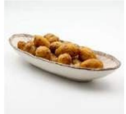
ROASTED BABY POTATOES (VG) SERVED WITH SEA SALT FLAKES £8