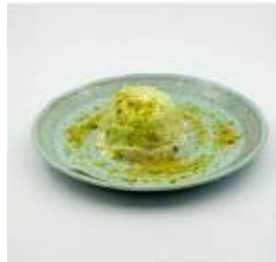
PISTACHIO DULCE DE LECHE LIGHT PISTACHIO MILK CAKE SOAKED IN SWEET PISTACHIO MILK TOPPED WITH CHANTILLY CREAM £10