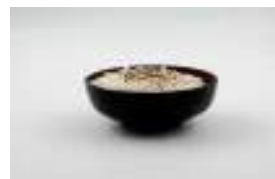
STICKY RICE (VG) SERVED WITH SESAME SEEDS