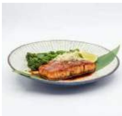
SALMON TERIYAKI PAN-SEARED SALMON IN HONEY GLAZED TERIYAKI SAUCE £25