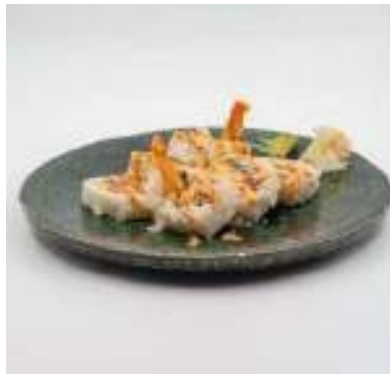
KING PRAWN TEMPURA MAKI 6PCS PRAWN TEMPURA, AVOCADO, SPICY MAYO, FUTOMAKI COATED WITH A CRUNCH & SWEET SOY £14