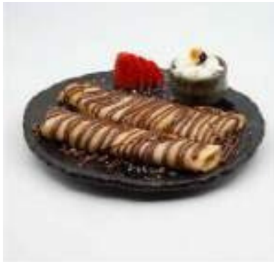
NAUGHTY NUTELLA FRESH CREPE WITH NUTELLA AND BANANA SLICES £9