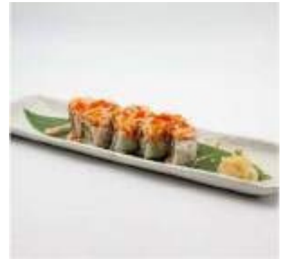
SPICY CRUNCHY SALMON 8PCS KING SALMON, AVOCADO, SPICY MAYO, SEARED SALMON TOPPED WITH TOBIKO £14