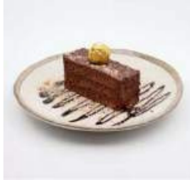
THE FERRERO A RICH CHOCOLATE BLEND CAKE TOPPED WITH FERRERO ROCHER £10