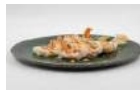
KING PRAWN TEMPURA MAKI 6PCS PRAWN TEMPURA, AVOCADO, SPICY MAYO, FUTOMAKI COATED WITH A CRUNCH & SWEET SOY