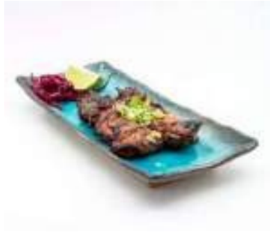
CHICKEN WINGS £12.5