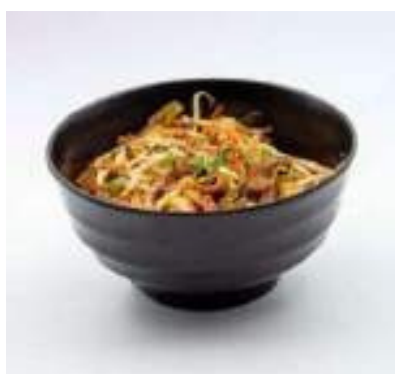
CHICKEN NOODLES CHICKEN, VEGETABLES WITH YAKISOBA SAUCE AND NOODLES £18