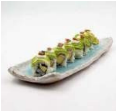
VEGETABLE PHILADELPHIA MAKI (V) 8PCS MANGO PIECES, CREAM CHEESE, AVOCADO, BLACK TRUFFLE £13