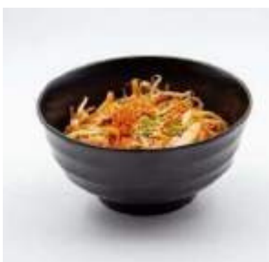
TIGER PRAWNS NOODLES TIGER PRAWNS, VEGETABLES WITH YAKISOBA SAUCE AND NOODLES £20