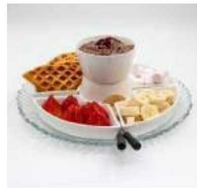
CHOCOLATE FONDUE WAFFLE PIECES, STRAWBERRIES, BANANA, MARSHMALLOW £30