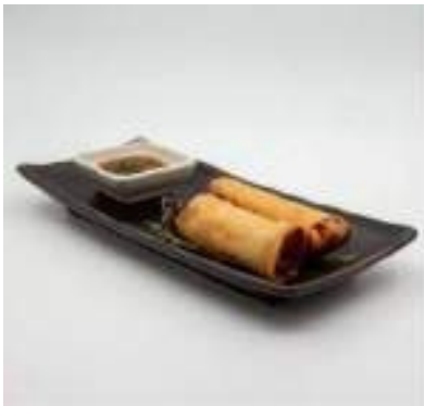
VEGETABLE SPRING ROLL (V) MIXED VEGETABLES WITH SWEET CHILLI SAUCE £9