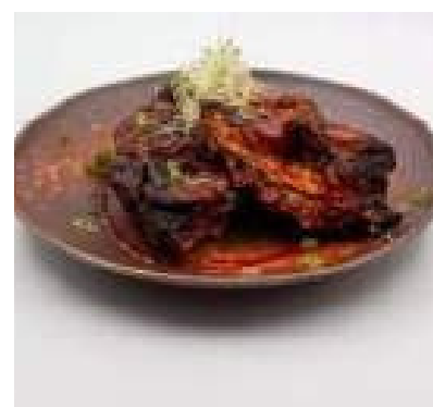
BABY CHICKEN GRILLED WHOLE MARINATED CHICKEN WITH KOREAN SPICY SAUCE £22