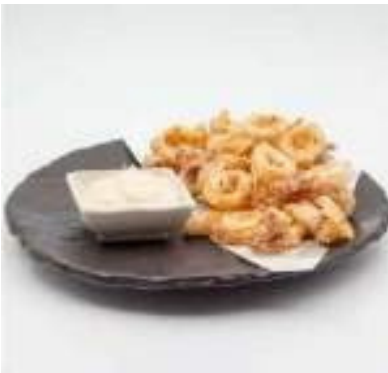
FRIED SQUID FLOUR DUSTED FRIED SQUID SERVED WITH CITRUS YUZU MAYONNAISE £14