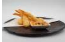
PRAWN TEMPURA FRIED PRAWNS WITH SPICY MAYO & CHIVES