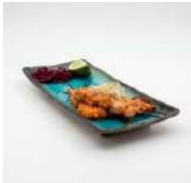
CHICKEN SKEWERS 2PCS GRILLED CHICKEN COATED WITH SWEET PEPPER TERIYAKI SAUCE £13