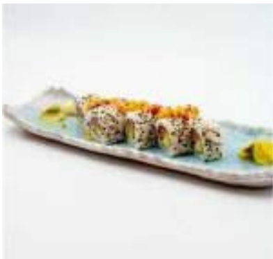
SALMON AVOCADO MAKI 8PCS RAW SALMON, AVOCADO, MIXED SESAME SEEDS FINISHED WITH MANGO SALSA £14