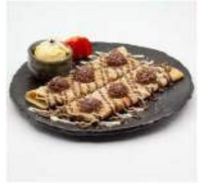
NOTHING BUT SAUCE FRESH CREPE WITH FERRERO ROCHER, NUTELLA, MILK AND WHITE CHOCOLATE SAUCE £9