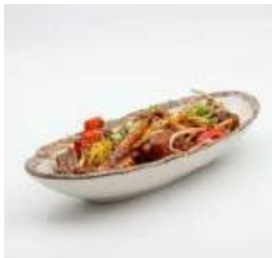
SWEET N SOUR CHICKEN CRUNCHY CHICKEN SERVED WITH SEASONAL VEGETABLES, RICE £18