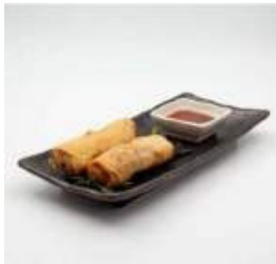
CHICKEN SPRING ROLL CHICKEN, VEGETABLES WITH SWEET CHILLI SAUCE £10