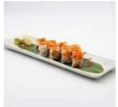
SPICY TUNA MAKI 8PCS SPICY TUNA, CUCUMBER WITH TOGARASHI POWDER £14