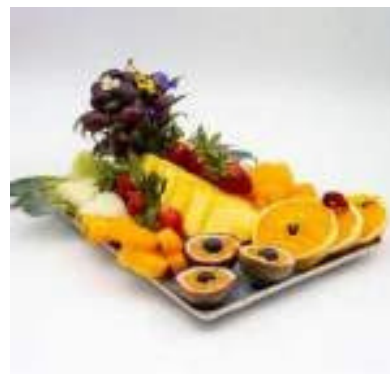
FRUIT PLATTER &NBSP; MEDIUM - £25 LARGE - £35