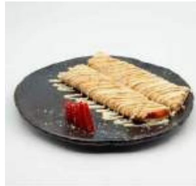
STRAWBERRY INDULGENCE FRESH CREPE WITH STRAWBERRIES AND WHITE CHOCOLATE SAUCE £9