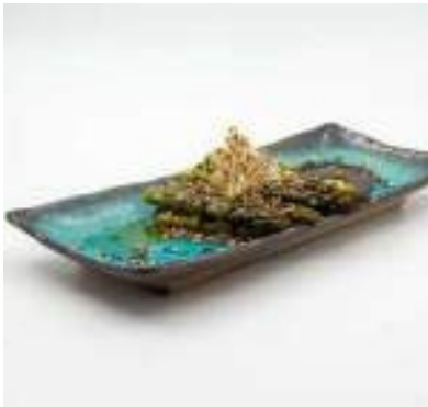
GRILLED ASPARAGUS (VG) TERIYAKI SAUCE & SESAME SEEDS £8