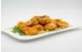
DYNAMITE CAULIFLOWER (V) BATTER-FRIED CAULIFLOWER COATED WITH DYNAMITE SAUCE, FRESH SPRING ONION, CHILLIES