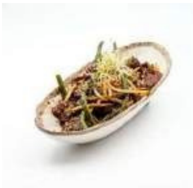
BEEF STIR FRY WOK-FRIED BEEF WITH GREEN BEANS & CHILLI GARLIC SAUCE, RICE £18.5