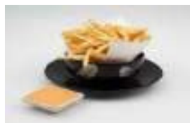
SKINNY FRIES WITH SEA SALT FLAKES