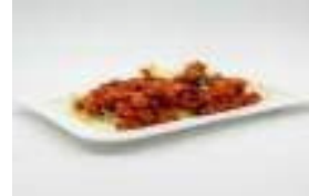
CHICKEN KARRAGE CRUNCHY CHICKEN THIGHS COATED IN RED PEPPER HONEY GLAZED SAUCE