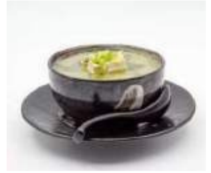
MISO SOUP (VG) TRADITIONAL JAPANESE SOUP WITH TOFU, WAKAME SEAWEED & MUSHROOM £8