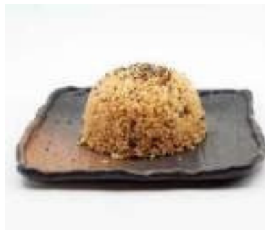
CHICKEN FRIED RICE CHICKEN, MIXED VEGETABLES SERVED WITH SPICY VINAIGRETTE SOYA SAUCE £8