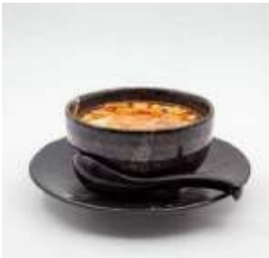
TOM YUM SOUP SPICY THAI SOUP WITH PRAWNS & MUSHROOMS £9