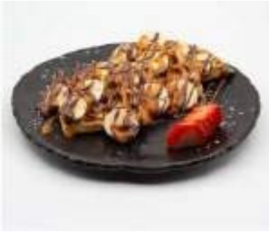
BANOFFEE DELIGHT FRESH WAFFLE WITH BANANA SLICES, NUTELLA, TOFFEE SAUCE £10