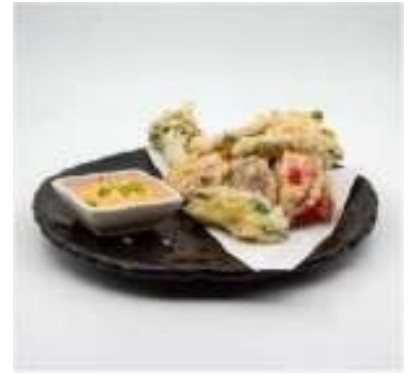
VEGETABLE TEMPURA (V) FRIED VEGETABLES WITH SPICY MAYO & CHIVES £12