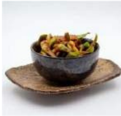
SPICY EDAMAME (VG) SERVED WITH GARLIC SAUCE £7.5