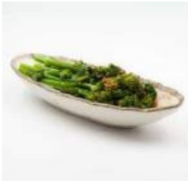
STEAMED BROCCOLI (V) STEM BROCCOLI WITH GARLIC BUTTER £8