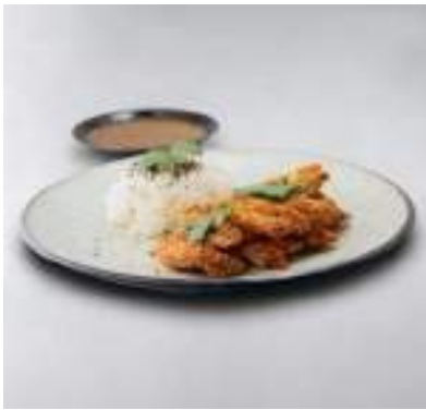
CHICKEN KATSU CURRY FRIED BREADED CHICKEN WITH JAPANESE CURRY GRAVY AND STICKY RICE £18.5