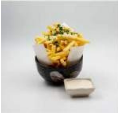
TRUFFLE FRIES (V) TRUFFLE OIL, PARMESAN SHAVINGS, CHIVES & TRUFFLE MAYO £8