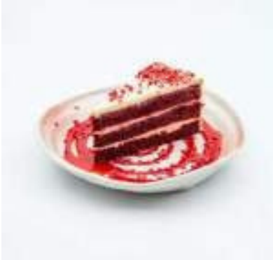
RED VELVET SPONGY RED VELVET CAKE TOPPED WITH DRIED RASPBERRIES £10