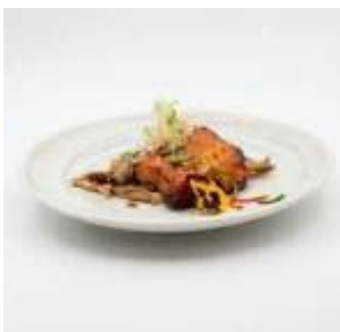
BLACK COD COD FILLET MARINATED IN MISO, BAKED TO PERFECTION WITH WILD MUSHROOMS £32.5