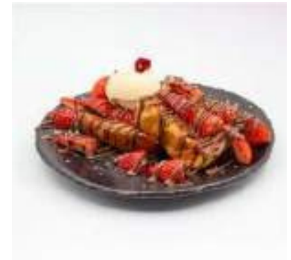
SYON FRENCH TOAST BRIOCHE FRENCH TOAST WITH CHOCOLATE SAUCE STRAWBERRIES & VANILLA ICE CREAM £12