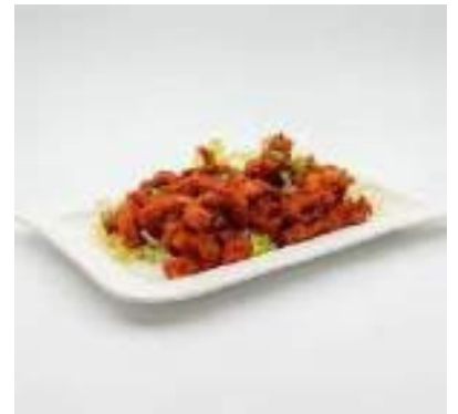
CHICKEN KARRAGE CRUNCHY CHICKEN THIGHS COATED IN RED PEPPER HONEY GLAZED SAUCE £13