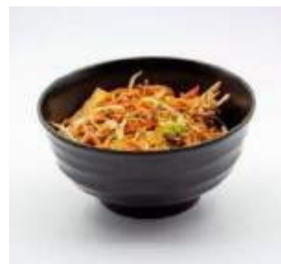
VEGETABLE NOODLES (V) SEASONAL VEGETABLES WITH YAKISOBA SAUCE AND NOODLES £16.5