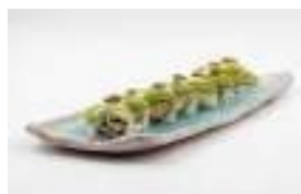
VEGETABLE PHILADELPHIA MAKI (V) 8PCS MANGO PIECES, CREAM CHEESE, AVOCADO, BLACK TRUFFLE