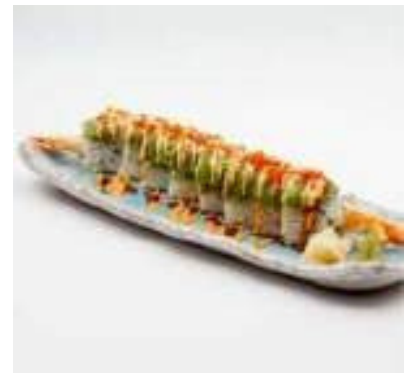
DRAGON ROLL 8PCS TEMPURA PRAWN, AVOCADO, FISH ROE SERVED WITH SWEET SOY AND SPICY MAYO £15