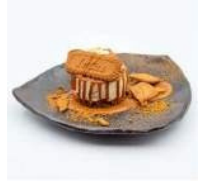
BISCOFF CHEESECAKE CARAMEL VANILLA CHEESECAKE WITH LOTUS PIECES TOPPED WITH BISCOFF GLAZE £10