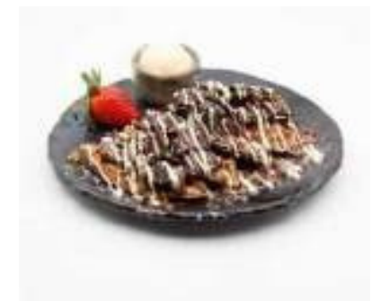
VINTAGE OREO FRESH WAFFLE WITH MILK & WHITE CHOCOLATE SAUCE, OREO PIECES £10