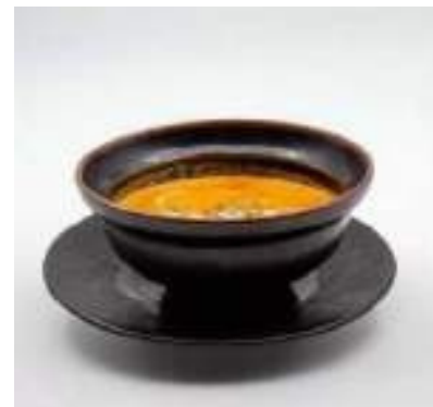
BUTTER CHICKEN CURRY TANDOORI CHICKEN, YOGHURT, CREAM, TOMATO SAUCE WITH MILD SPICES, RICE £18.5