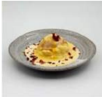
SAFFRON DULCE DE LECHE LIGHT SAFFRON MILK CAKE SOAKED IN SWEET SAFFRON MILK TOPPED WITH CHANTILLY CREAM £10